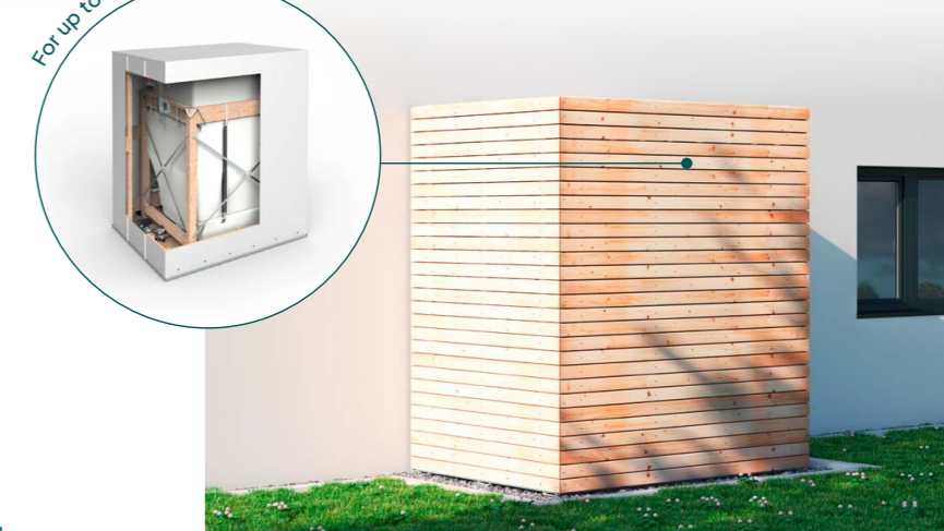
Standard version with foil. Optional: Do-It-Yourself